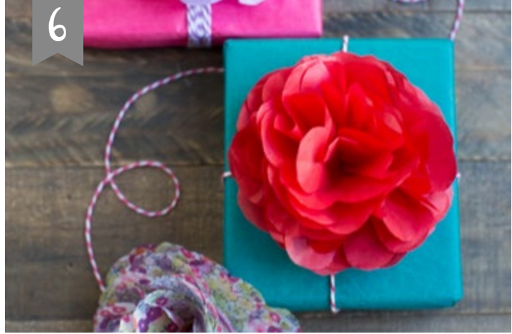
Tie on top of a gift or use for party decoration.