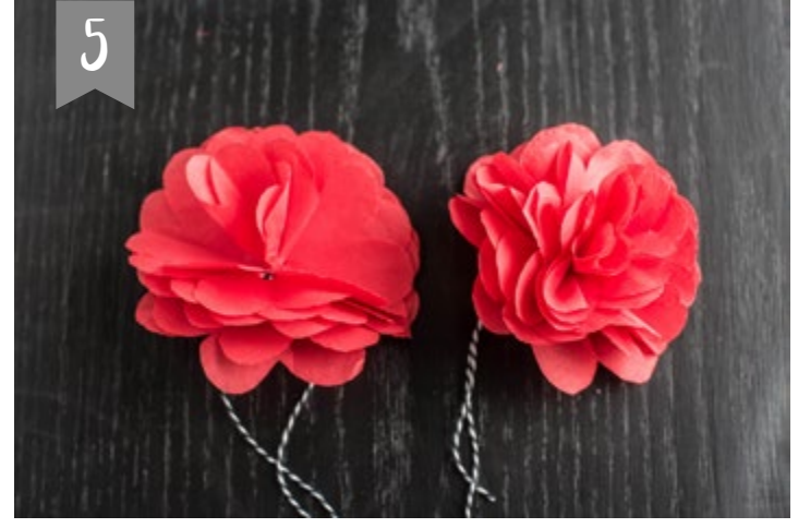
Tie twine through hole.