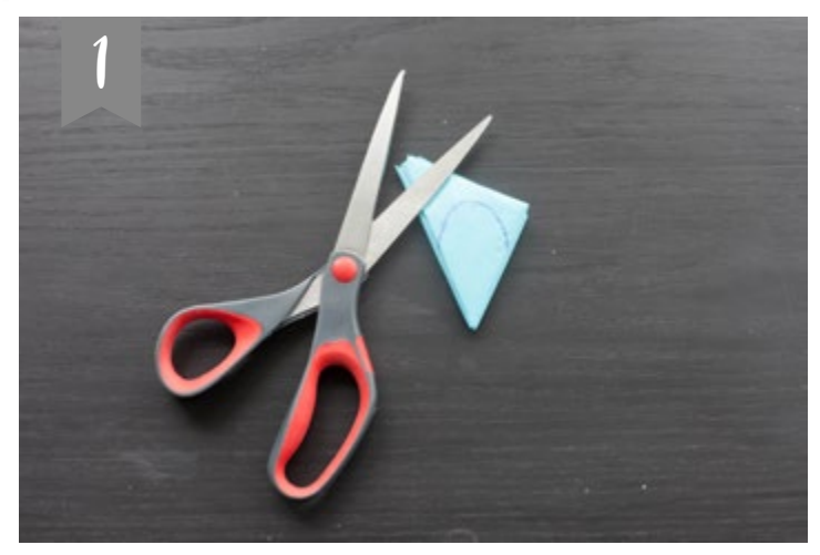
With folded edge as point mark a half circle onto triangle.