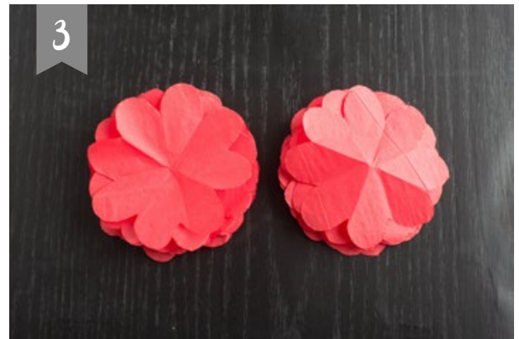
Open tissue petals and stock 8 layers in rotation.