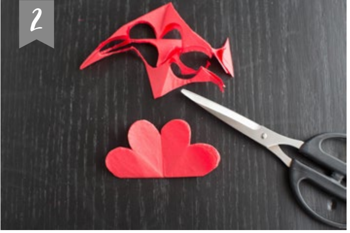
Trim tissue with scissors discarding top of triangle.