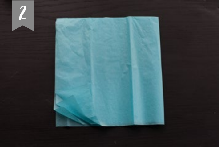
Fold square tissue in half twice, at this point you should have 4 layers.