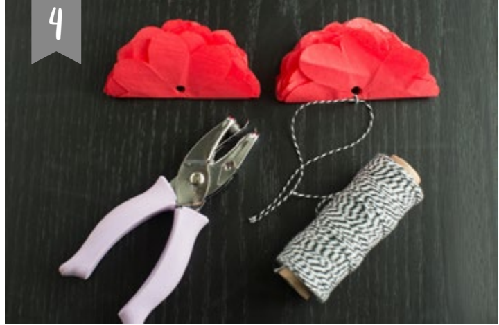
Fold petals stack in half and punch hole in center. When you reopen petals you will have 2 holes.