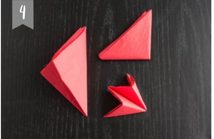
Fold diagonally to create a triangle, fold triangle again to form a smaller triangle.