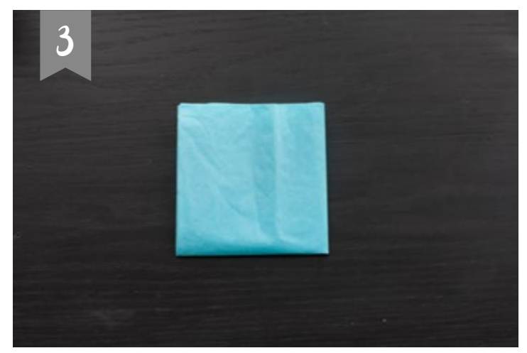
Fold again two times. You should have 16 layers.