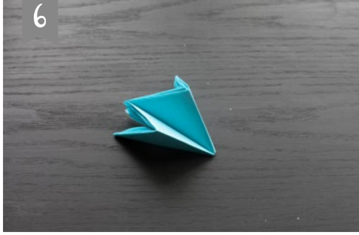
Fold other half of triangle to form small triangle.