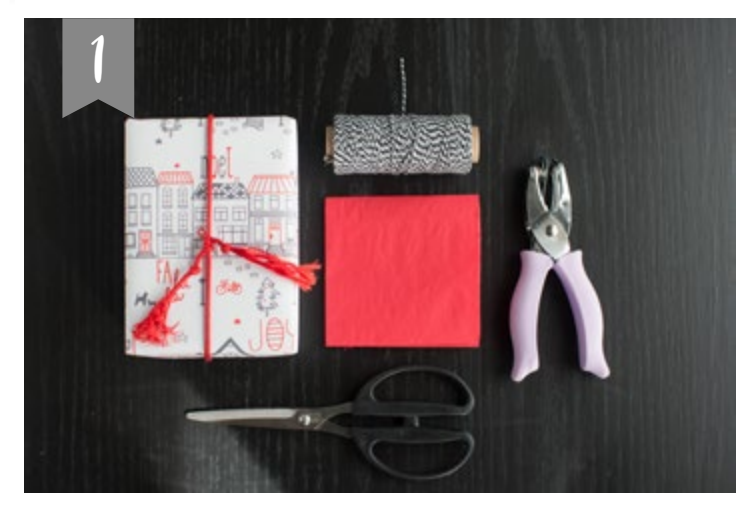
You will need: tissue paper, scissors, twine, punch